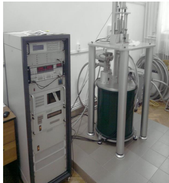
12 T VSM