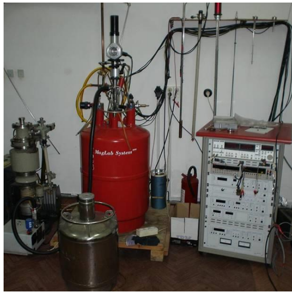
Low temperature measurements