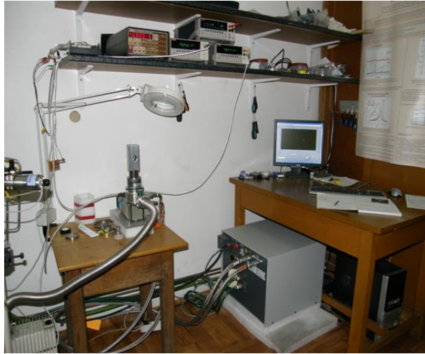
Cooling system for electrical resistivity measurement function of temperature