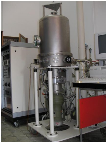
Sputtering system for film synthesis in DC and RF modes.